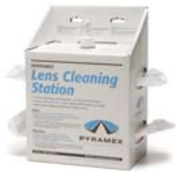
LCSI20 Lens Cleaning Station with 16 oz. Cleaning Solution 1200 Tissues