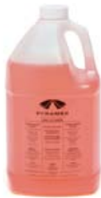
GALSOL Gallon of Lens Cleaning Solution