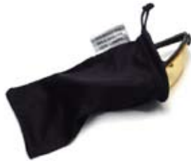
PYRBAG Cloth Drawstring Spectacle Case