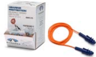
RP2001 Reusable Earplugs