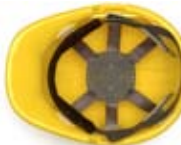
Hard Hat Cap Style 6 Point Snap Lock Suspension