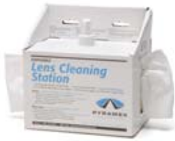
LCSI10 Lens Cleaning Station with 8 oz. Cleaning Solution 600 Tissues