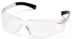
S2510S** / S2510ST** (Anti-Fog)

Meets or exceeds ANSI Z87.1-2003 High Impact Requirements *CE EN166 Certified *CAN/CSA Z94.3-07