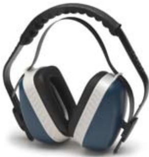
PM1010 Ear Muff NRR 25db Large soft foam ear cups Durable padded nylon headband Individually packaged

All hearing protection meets or exceeds ANSI S3.19 Requirements *CE EN 352-2:2002 Certification