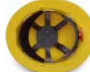
Hard Hat Full Brim Style 6 Point Ratchet Suspension