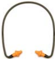
BP2000 Conical Banded Earplugs