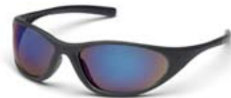
SS3365E* Blue Mirror Lens with Silver Frame

Exceeds ANSI Z87.1-2003 High Impact Requirements *CE EN166 Certified