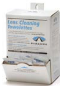
LCTI00 100 Individually Packaged Lens Cleaning Towelettes