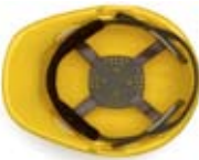
Hard Hat Cap Style 4 Point Snap Lock Suspension