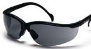
SB1820S**/ SB1820ST** (Anti-Fog) Gray Lens with Black Frame

Exceeds ANSI Z87.1-2003 High Impact Requirements *CE EN166 Certified *CAN/CSA Z94.3-07