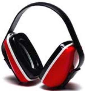
PM2010 Ear Muff NRR 22db Durable nylon headband Soft foam ear cups Individually packaged