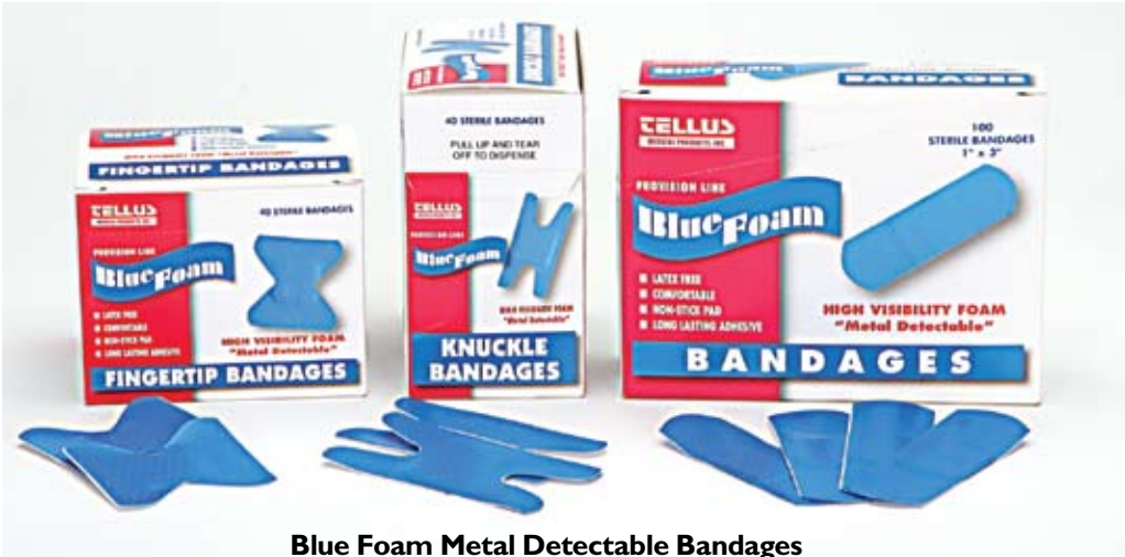
Blue Foam Metal Detectable Bandages

Blue Metal Detectable Bandages Bright blue fabric and foam adhesive bandages provide instant detection if lost during food processing or preparation. The non-stick pad contains metal foil underneath the pad. If lost, will instantly trigger a pre-tested metal detector. Available in Non-Metal Detectable too!