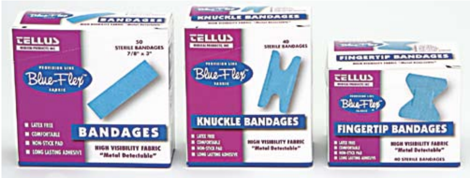
Blue Fabric Metal Detectable Bandages

FOAM BANDAGES ARE METAL DETECTABLE AND WATER PROOF. STAYS ON IN DRY OR WET CONDITIONS.