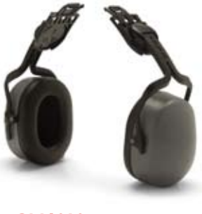
CM6010 Gray Cap Mounted Muff NRR 27db Soft foam ear cups Fits wide variety of hard hats Easily accessible while working Flip down over ears to use Flip up when not in use Individually packaged Meets ANSI S3.19 requirements