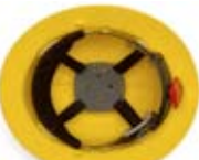
Hard Hat Full Brim Style 4 Point Ratchet Suspension