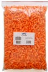
PD500 Ear Plug Dispenser Convenient dispenser holds 500 disposable earplugs. Quick and easy use for workers. Durable plastic design has easy twist knob and catch basin to prevent plugs from falling to the ground. Replacement bag of earplugs is available for easy refill. NRR 32db PD500R 500 Pair of

NRR 32db. Disposable metal detectable corded ear plugs provide contoured fit. Plug gently expands and self adjusts to all size ear canals. The soft foam earplugs provide all day comfort. Packaged in convenient dispenser box - 100 pair per box.