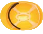
Bump Cap 4 Point Snap Lock Suspension