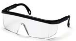
SB410S**/ SB410ST* (Anti-Fog) Clear Lens with Black Frame

Exceeds ANSI Z87.1-2003 High Impact Requirements *CE EN166 Certified *CAN/CSA Z94.3-07