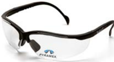
SB1810R10* Clear +1.0 Lens with Black Frame

Available in 3 Lens Colors | Available in 5 Magnifying