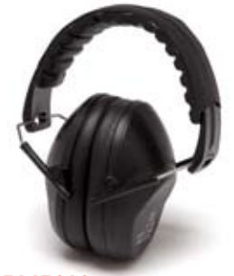
PM5010 Ear Muff NRR 31db Low Profile Design Soft foam ear cups Adjustable to fit all sizes Fold-away padded headband Individually packaged