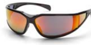
SB5155DT* (Anti-Fog) Sky Red Lens with Black Frame

Exceeds ANSI Z87.1-2003 High Impact Requirements *CE EN166 Certified