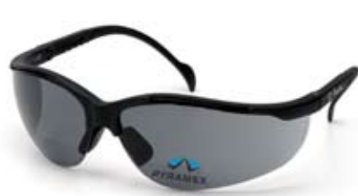
SB1820R15 Gray +1.5 Lens with Black Frame