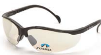
SB1880R15 Indoor/Outdoor Mirror +1.5 Lens with Black Frame