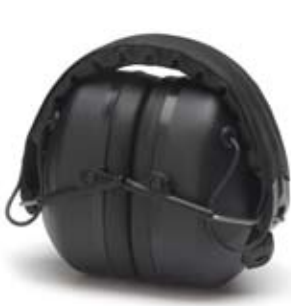
PM4010 Electronic Ear Muff Offers electronic suppression of dangerous impulse noises common to industrial users and shooters Amplifies surrounding voices, important signals and warnings NRR 30db (neutral position) Suppresses noise over NRR 82 db Soft head pad for all day comfort Foam-filled padded ear cups fit securely and comfortably over the ear Electronics are designed to limit amplified sound levels over 82db Batteries not included Individually packaged Meets ANSI S3.19-1974