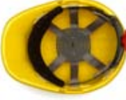
Hard Hat Cap Style 6 Point Ratchet Suspension