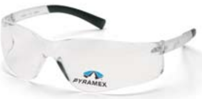
S2510R15 Clear +1.5 Lens with Black Frame