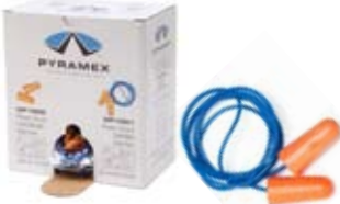
DPI000* (not shown) Disposable Uncorded Earplugs DPI001*