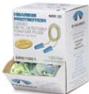
DPD1001 Metal Detectable Disposable Corded Earplugs