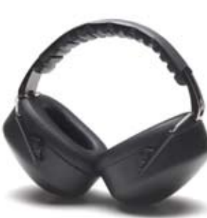
PM3010 Ear Muff NRR 27db Soft foam ear cups Adjustable to fit all sizes Fold-away, padded headband Individually packaged