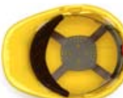
Hard Hat Cap Style 4 Point Ratchet Suspension