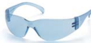
S4160S* Infinity Blue Lens with Infinity Blue Frame

Exceeds ANSI Z87.1-2003 High Impact Requirements *CAN/CSA Z94.3-07